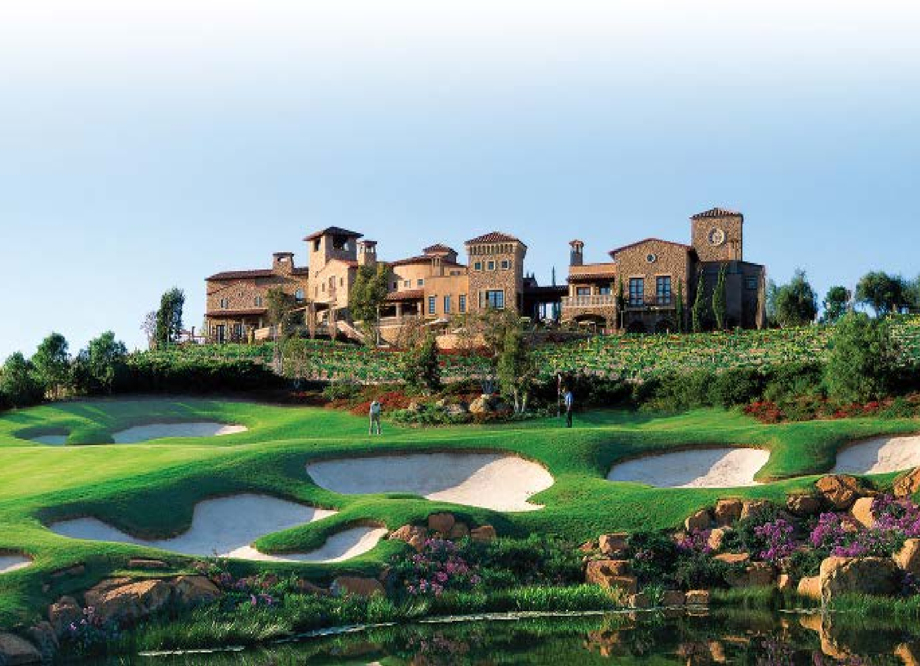
The Bridges Club House, The Bridges, Rancho Santa Fe